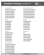
K-5 Course List

Click below to access our Course Lists .