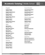
MS Course List